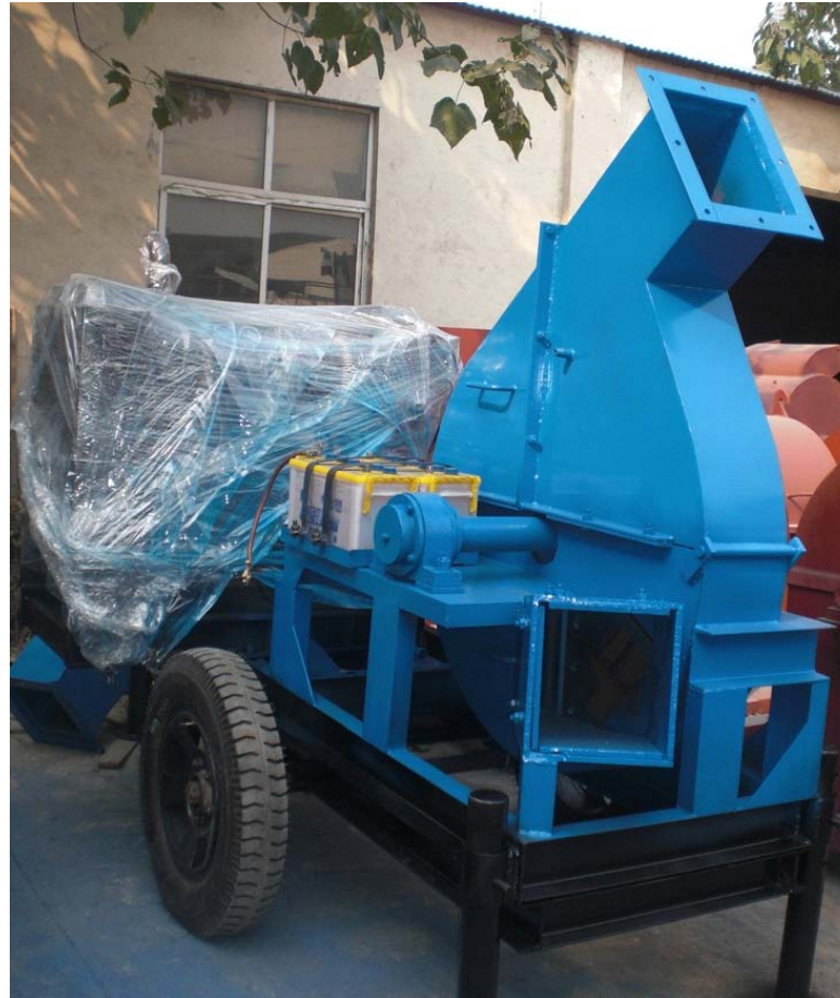
Diesel movable wood chipper